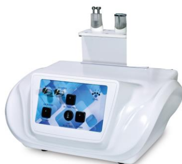
2 in 1