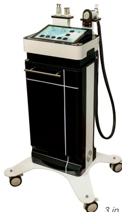
3 in 1